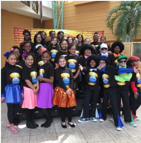
Motown in the Gem City • Photo: Ray Wylam