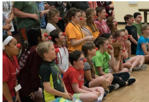
CIRCUS 1903 Summer Camp