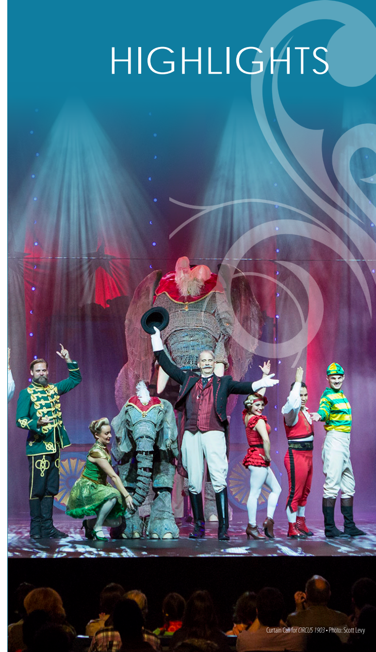
Curtain Call for CIRCUS 1903 • Photo: Scott Levy