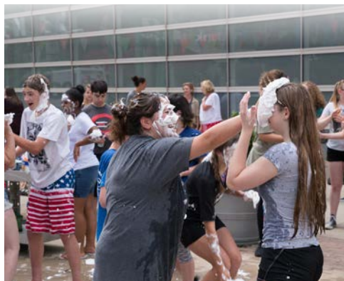
CIRCUS 1903 Summer Camp • Photo: Ron Valle