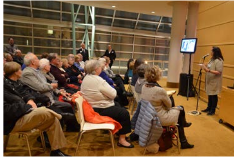
Background on Broadway