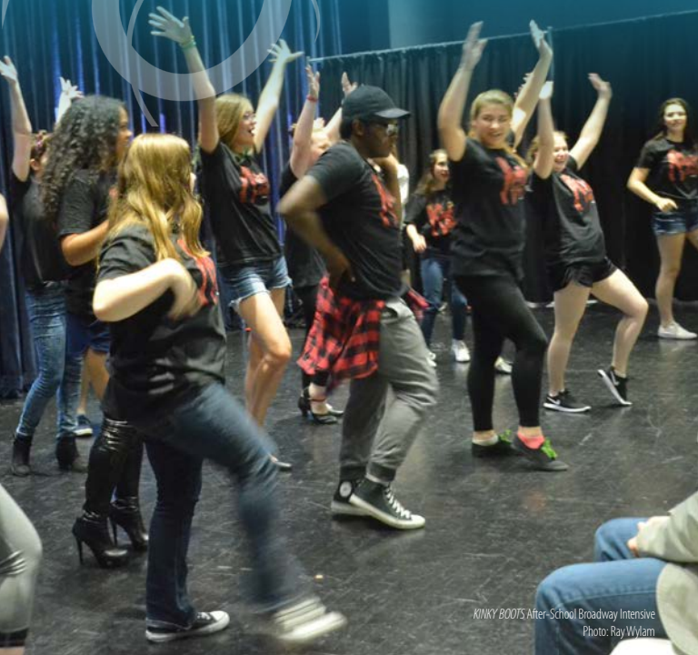
KINKY BOOTS After-School Broadway Intensive