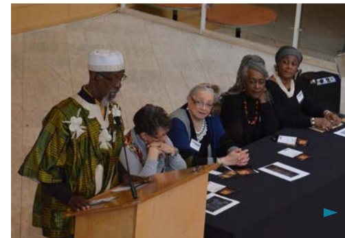
Visual Voices • Photo: Ray Wylam